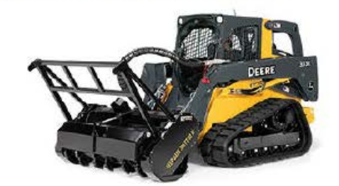
New Support Services

Based on our client's requests to expand our support services, Eastern Solutions now offers the following (Please note these services are for existing rental clients only):