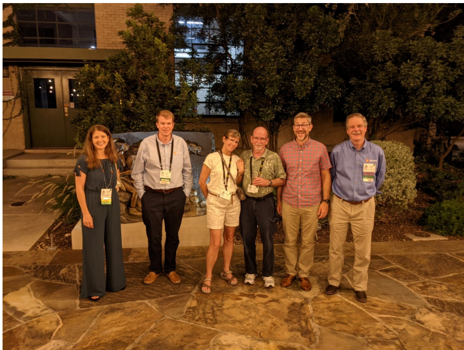
Carolinas Chapter members attending the meeting